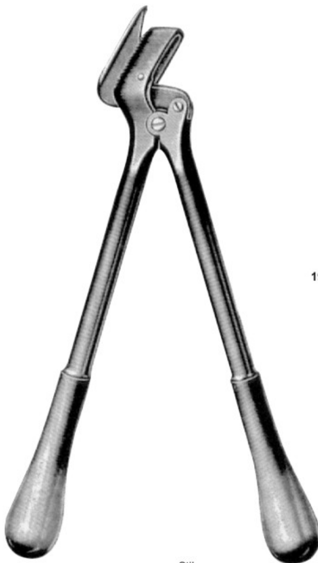
Stile 194-115-20 20 cm 194-115-23 23 cm 194-115-26 26 cm 194-115-37 37 mm