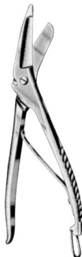
194-130-21 Mod. Seutin 21,0 cm