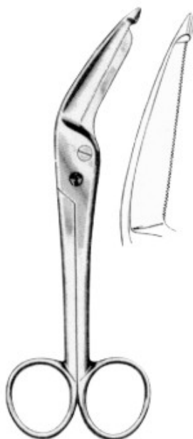
194-200-19 Lister Exentric 19,0 cm