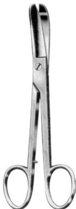
194-195-23 Lorenz 23,0 cm