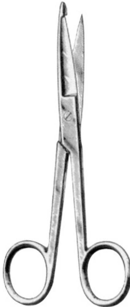
194-155-14 Knowles 14,0 cm