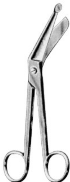
194-223-23 Bergmann 23,0 cm